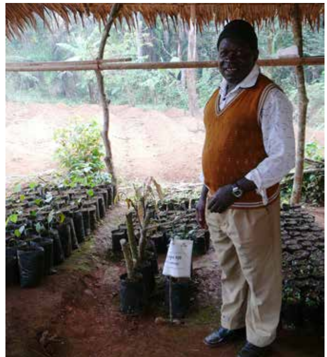
Village tree nursery in Batibo, Cameroon. "Fertilizer trees" are sold to farmers for soil fertility replenishment (2-year improved fallows that increase crop yields two- to threefold).

The World Bank needs to stop the BBA indicators, DB ranking system, and its promotion of policies that benefit the economic interests of agribusinesses through the opening of seed and fertilizer markets given the threat they constitute for family farmers. There are no two ways about this—the indicators for seeds and fertilizer serve a small group of agribusiness companies and will eliminate the little protection that exists for the livelihoods of African farmers. The World Bank has never been held accountable for its liberalization policies in Africa despite a track record of hurting small farmers, and it is deeply concerning that the Bank now has an even bigger opportunity to destroy what is left of Africa's food sovereignty.