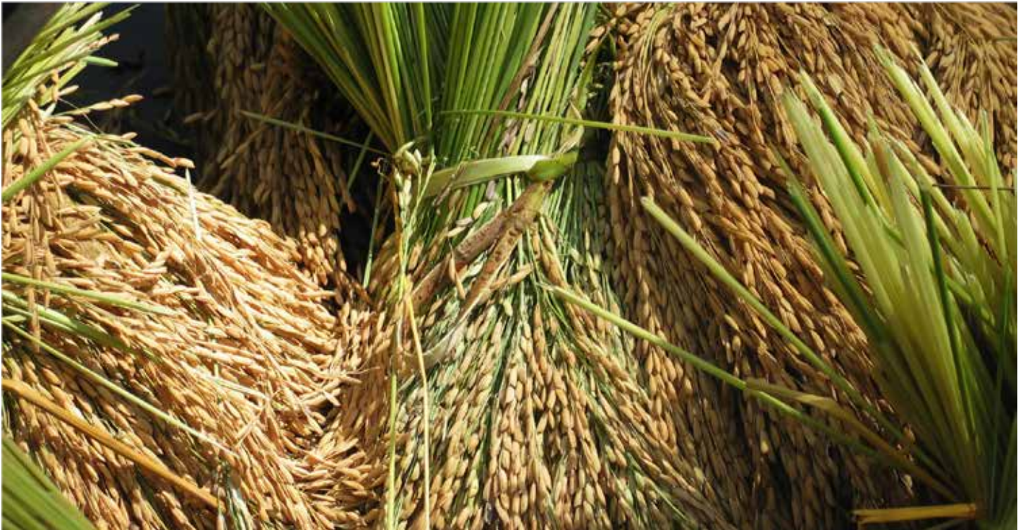
Rice harvest in Burkina Faso.

prices, contamination by genetically modified crops, or the spread of ineffective or unsustainable varieties.