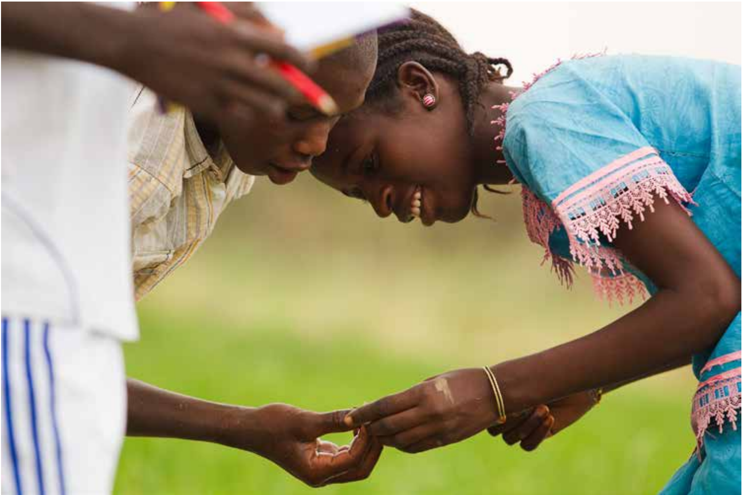
Farmers look for insects while others measure plants in a West African integrated production and pest management program (IPPM) rice field school in Kodith, Senegal. Farmers learn how to maximize production and minimize pesticide use.

The World Bank's policy recommendations and rankings are based on a development paradigm that promotes large-scale industrial agriculture and benefits corporations. The purported solutions to hunger and poverty it offers fit within this discourse. Traditional methods based on decades of knowledge and experience have been dismissed, even though they are often more effective and sustainable ways to increase yields, production, and incomes. 68